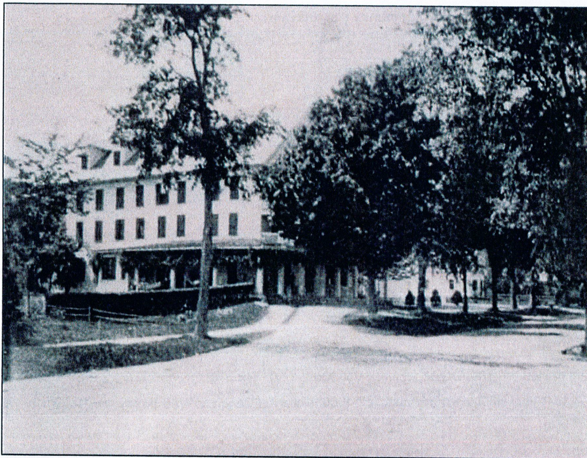
Photo 3: Moulton House Hotel, ca. 1897 ( Granite Monthly , Vol. XXIII, 166).