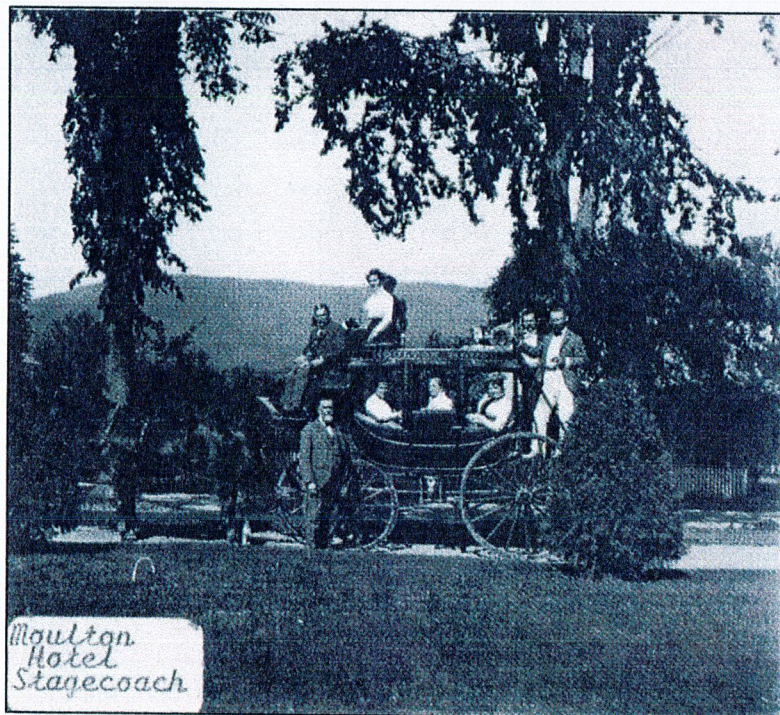
Photo 4: Moulton Hotel Coach was donated to the Boston Historical Society