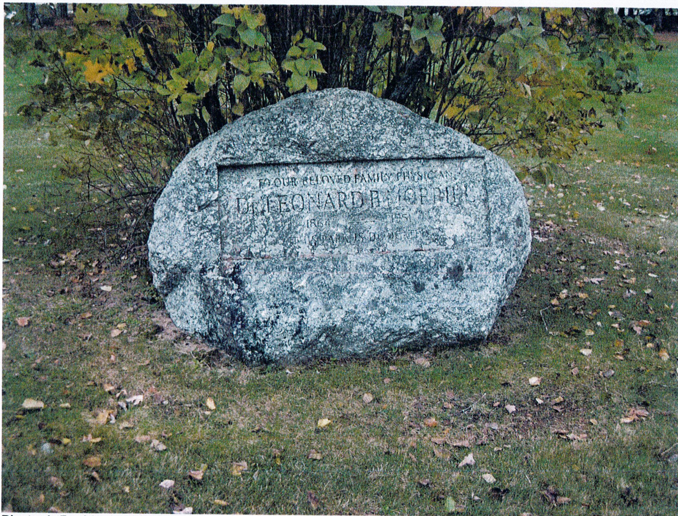
Photo 4: Boulder in Morrill Memorial Park (Photographed November 1, 2017)